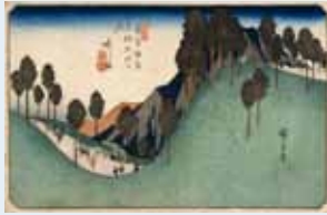
Japanese Woodblock Prints