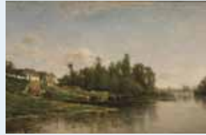
Traditional Western Painting