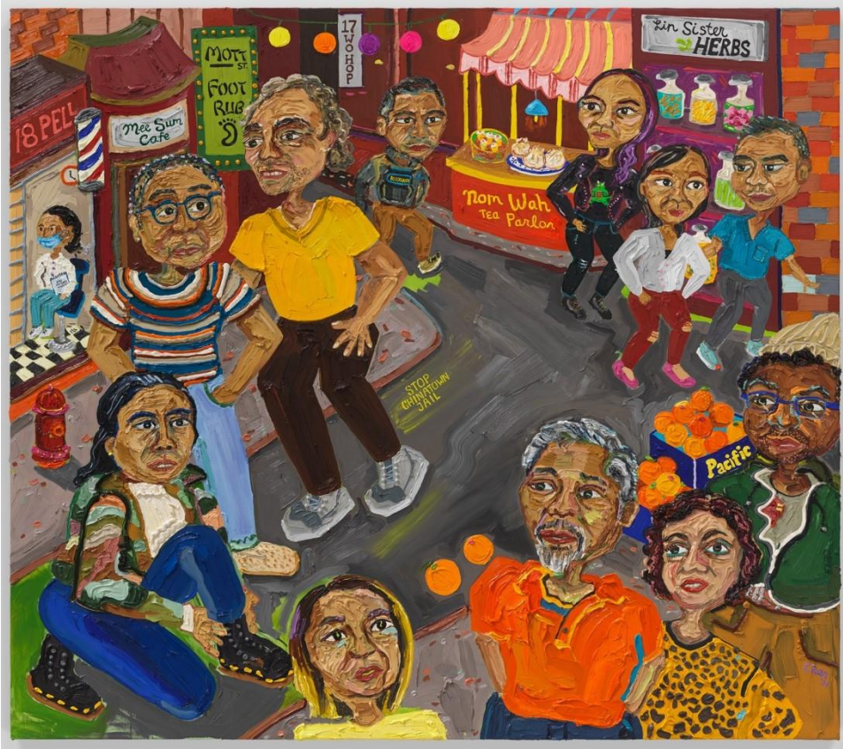
Susan Chen. Chinatown Block Watch , 2022. Oil on canvas. Brooklyn Museum, Promised gift of Carla Shen and Christopher Schott, L2024.8.2. © Susan Chen.

Chinatown Block Watch by Susan Chen (American, born Hong Kong) leans into the nostalgia and familiarity of its titular neighborhood. Chen depicts a bustling scene in New York City's Chinatown replete with familiar signage and sensations—dishes from Nom Wah Tea Parlor, the slogan "STOP CHINATOWN JAIL" sprayed onto the asphalt, overflowing cartons of oranges, and an almost claustrophobic density of pedestrians weaving past one another. Currently on view in the reinstated American Art galleries, this work builds upon the Museum's collection of works depicting New York City, as well as its collection of works by Asian American artists.