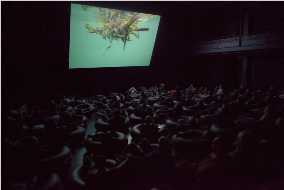
Coco Fusco. And Then the Sea Will Talk to You, 2012. Single-channel video (color, sound). Brooklyn Museum, Gift of the Contemporary Art Committee, in honor of the Brooklyn Museum's 200th Anniversary, 2024.44.

A major figure within contemporary art, Brooklyn-raised artist Coco Fusco has worked as an artist, scholar, professor, and curator discussing Cuban and Caribbean art for the past several decades. In And Then the Sea Will Talk to You , Fusco narrates her journey of taking her deceased mother's ashes from New York back to Cuba. The film is a compelling and intensely personal meditation on messy, contradictory, and sentimental feelings about one's ancestral homeland. This anniversary gift expands the Museum's holdings of works by Caribbean and local artists.