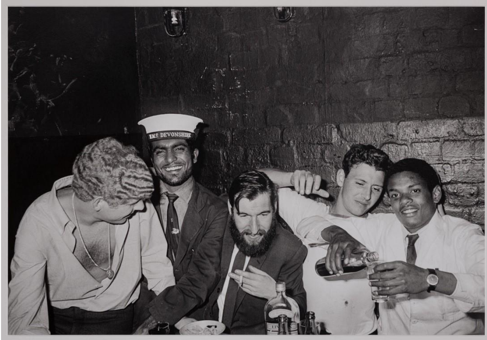
Billy Monk. The Catacombs, 23 December 1967, 1967 . Pigment ink on archival paper. Brooklyn Museum, Gift of J. A. Forde, 2024.32. © Billy Monk Collection. (Photo: Brooklyn Museum)

This gift is one of the most iconic images from Billy Monk's oeuvre and the first of the South African artist's works to enter the Brooklyn Museum's collection, bolstering the holdings that depict queer realities. With a 35 mm Pentax camera, Monk photographed both friends and strangers in underground sanctuaries and nightclubs such as the Catacombs in Cape Town, South Africa. His close connection to many of the clubs' patrons allowed him to capture intimate moments. This piece presents a rare glimpse into a moment within Cape Town's history of apartheid, shedding light on the lived realities of partiers of all races, LGBTQIA+ identities, and economic backgrounds.