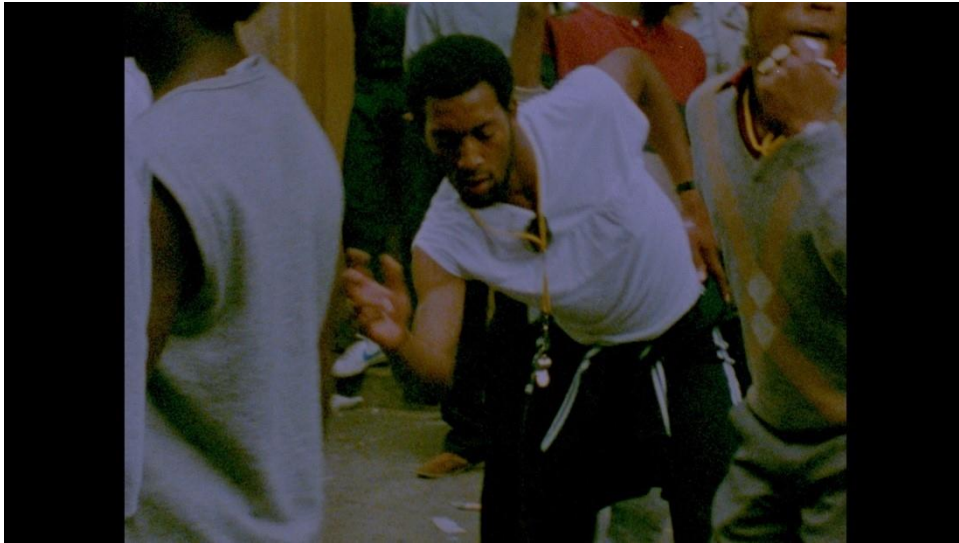
Isaac Julien. Territories, 1984. Single-channel video (color, sound). Brooklyn Museum, Gift of the Contemporary Art Committee, in honor of the Brooklyn Museum's 200th Anniversary, 2024.45.

This anniversary gift examines Britain's Black community in the 1980s through Carnival, a cultural touchstone with origins in Trinidad and other Caribbean island communities. British artist Isaac Julien's films have cemented his status as a twenty-first-century icon, whose work has been exhibited throughout New York, the United States, and the world. In Territories , Julien incorporates historical footage, Caribbean musical forms, and audio recordings from the Notting Hill Carnival, demonstrating that this event in London is about cultural agency, freedom of expression, and equality.