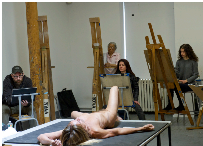
Iggy Pop Life Class, February 21, 2016

November 4, 2016–March 26, 2017 5th Floor adjacent to the Luce Center for American Art