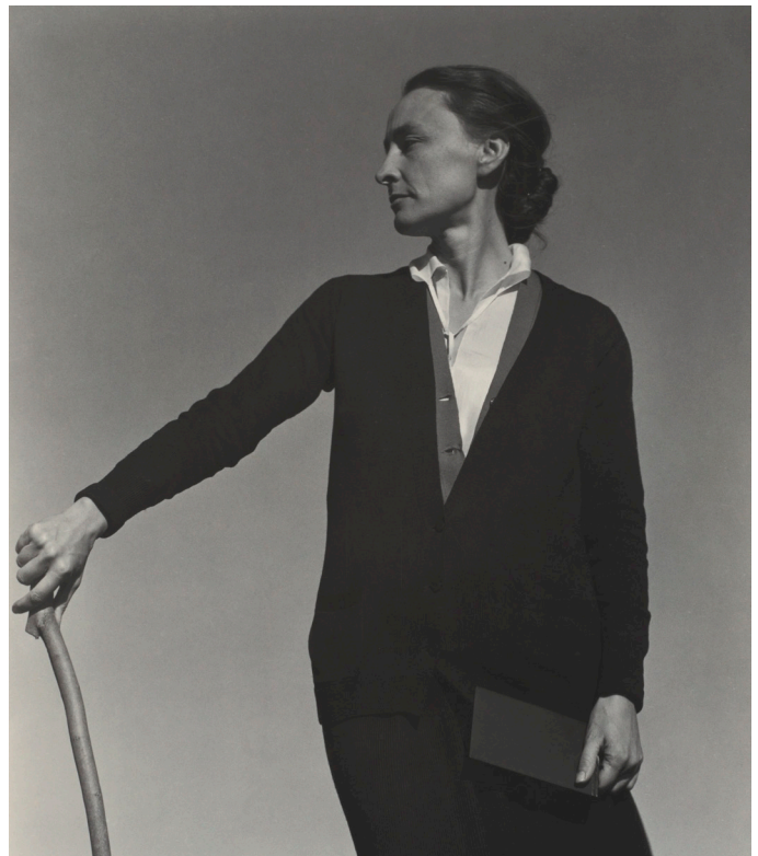
Alfred Stieglitz (American, 1864–1946). Georgia O'Keeffe, Prospect Mountain, Lake George, 1927. Gelatin-silver print, 4 5 / 8 x 3 11 / 16 in. (11.8 x 9.3 cm). National Gallery of Art, Washington, DC; Alfred Stieglitz Collection, 1980.70.223