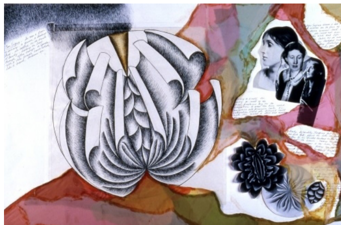
Judy Chicago (American, b. 1939). Study for Virginia Woolf plate , 1977. Ink, photo and collage on paper, approx. 24 x 36 in. (61 x 91.4 cm). © 2016 Judy Chicago / Artists Rights Society (ARS), New York

Elizabeth A. Sackler Center for Feminist Art