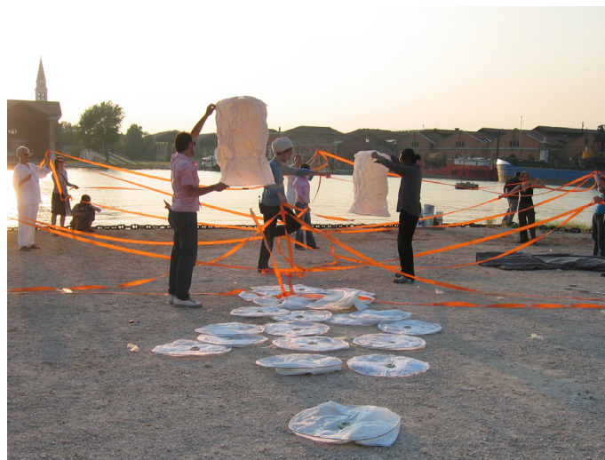
Installation view of Utopia Station at La Biennale di Venezia, 50th International Art Exhibition, June 15–November 2, 2003.

Iris and B. Gerald Cantor Gallery, 5th Floor, and in locations throughout the Museum and Brooklyn at large