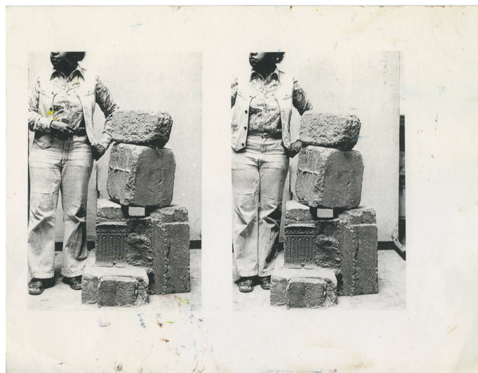
Beverly Buchanan (American, 1940–2015). Untitled (Double Portrait of Artist with Frustula Sculpture) , n.d. Black-and-white photograph with original paint marks, 8 1/2 x 11 in. (21.6 x 27.9 cm). Private collection.

Elizabeth A. Sackler Center for Feminist Art, 4th Floor