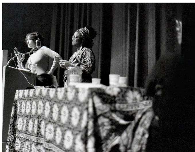
Lucy Lippard and Faith Ringgold at Brooklyn Museum Open Hearing "Are Museums Relevant to Women." Brooklyn, NY, December 12, 1971.

Elizabeth A. Sackler Center for Feminist Art