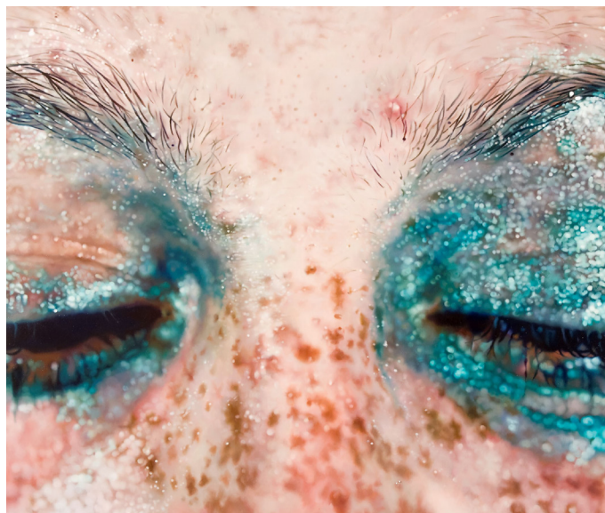
Marilyn Minter (American, b. 1948). Blue Poles , 2007. Enamel on metal, 60 x 72 in. (152.4 x 182.9 cm). Private collection, Switzerland

Morris A. and Meyer Shapiro Wing, 5th Floor