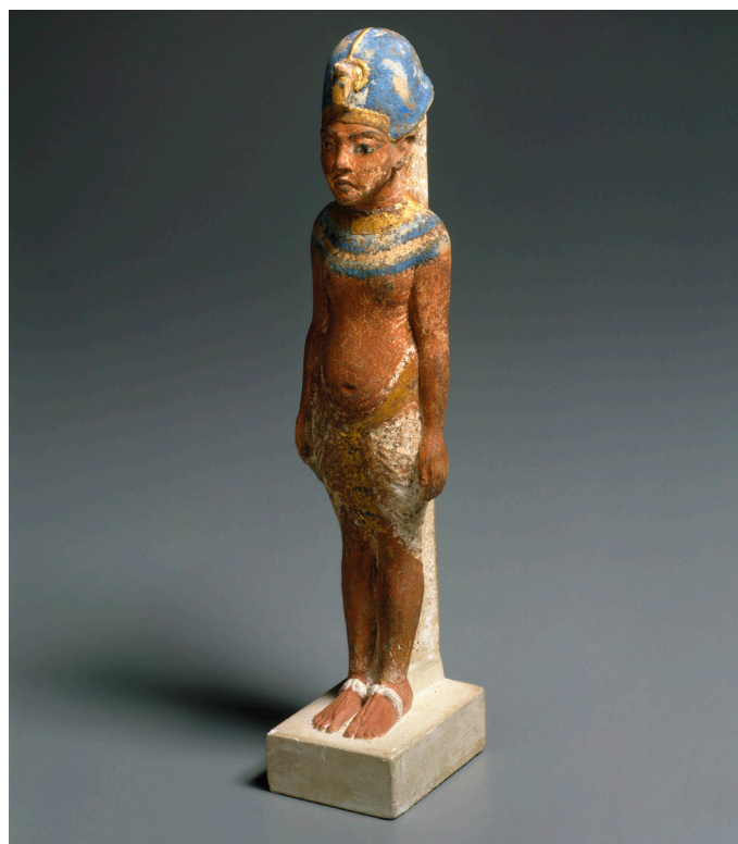
Amarna King , circa 1352–1336 B.C.E. Limestone, paint, gold leaf, 8\frac{3}{8} \times 1\frac{7}{8} in. (21.3 x 4.8 cm). Gift of the Egypt Exploration Society, 29.34.

Opening December 15, 2016 Egyptian Galleries, 3rd Floor