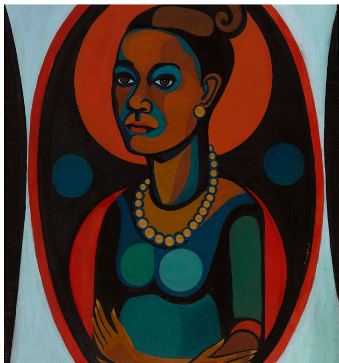
Faith Ringgold (American, born 1930). Early Works #25: Self-Portrait , 1965. Oil on canvas, 50 x 40 in. (127 x 101.6 cm). © 1965 Faith Ringgold. Gift of Elizabeth A. Sackler, 2013.96.

Stephanie and Tim Ingrassia Gallery of Contemporary Art and the Elizabeth A. Sackler Center for Feminist Art, 4th Floor