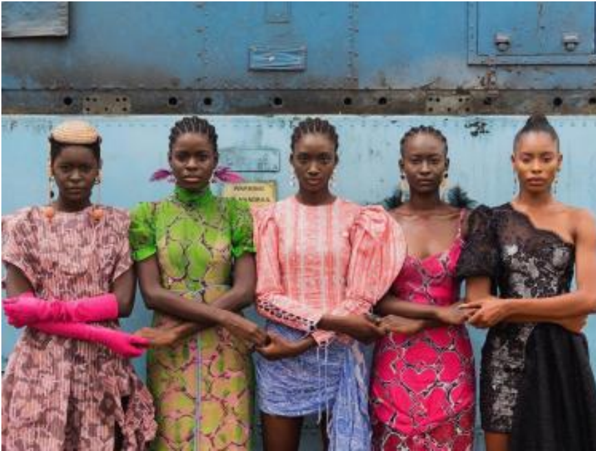
Models holding hands, Lagos, Nigeria, 2019.

Africa Fashion is a landmark exhibition celebrating the creativity, ingenuity, and global impact of African fashions from the 1960s independence era to today, showcasing examples of fashion design, photography, textiles, music, and visual art. The Brooklyn Museum's presentation will include works from our collections—namely, Arts of Africa; Egyptian, Classical, and Ancient Near Eastern Art; Arts of the Islamic World; and Photography—with commentary from designers whose fashions and self-expression have been inspired by those objects. By looking to the past, the designers are reimagining textiles from various regions of Africa as well as garments that consider sustainability of both cultural heritage and the environment. The presentation will shift perspectives on fashion in Africa and by African makers by examining trends, tastes, and traditions. Globally impactful and full of brilliance, the fashion scene on the African continent is dynamically reconstructed in Africa Fashion .