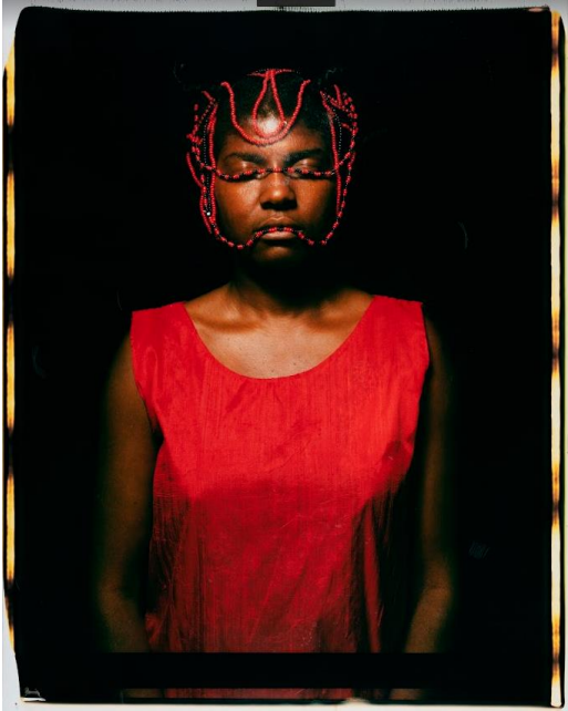
María Magdalena Campos-Pons (born Matanzas, Cuba, 1959). Red Composition (detail), from the series Los Caminos (The Path) , 1997. Triptych of Polaroid Polacolor Pro photographs, framed: approx. 32.3 x 22 x 2 in. (82 x 56 x 5 cm) each; approx. 32.3 x 66 x 2 in. (82 x 168 x 5 cm) overall. Collection of Wendi Norris.

Elizabeth A. Sackler Center for Feminist Art, 4th Floor