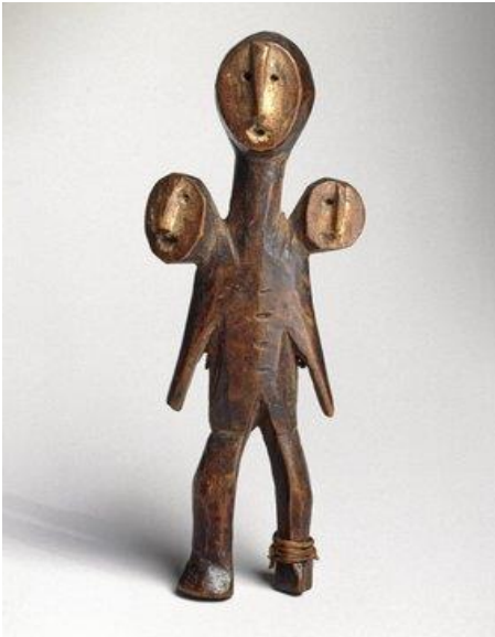
Lega artist. Three-Headed Figure (Sakimatwemtwe) , 19th century, South Kivu or Maniema Province, Democratic Republic of the Congo. Wood, fiber, kaolin, 5 1/2 x 2 x 1 1/8 in. (14 x 5.1 x 2.9 cm). Brooklyn Museum; Museum Expedition 1922, Robert B. Woodward Memorial Fund, 22.486.

The year 2023 marks the hundredth anniversary of a watershed exhibition of African art mounted at the Brooklyn Museum. Despite its problematic title, Primitive Negro Art, Chiefly from the Belgian Congo , the display included over fourteen hundred objects from African regions and, importantly, presented them as works of art. Reflecting upon that momentous exhibition's legacy, this centennial installation centers on the sakimatwemtwe figure. Meaning "many heads" in the Bwami society of the Lega peoples of the Democratic Republic of the Congo, sakimatwemtwe symbolizes the consideration of multiple perspectives—a principle that this installation aims to achieve. While highlighting African works acquired for the 1923 exhibition, Sakimatwemtwe: A Century of Reflection on the Arts of Africa contextualizes them within a more holistic view of African creativity at the time, in part by incorporating works by early twentieth-century African modernists.